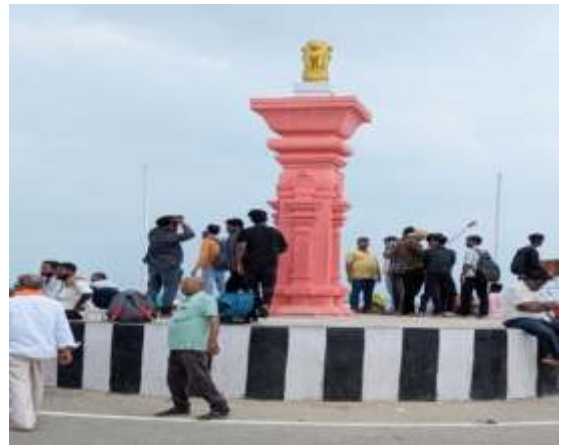
Ashoka Pillar and Church Ruins at Dhanushkodi