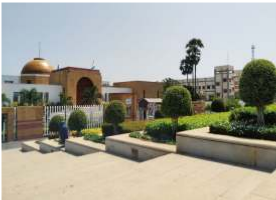
Dr APJ Abdul Kalam Museum

gentle breeze at the top where the temple is located was very calming.