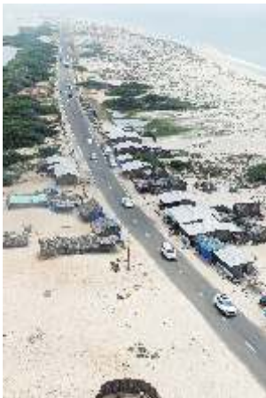
View from the Lighthouse

former, surrounded by the Bay of Bengal on one side and the Gulf of Mannar on the other, has many legends attached to it pertaining to Shri Rama. We had to climb numerous steps to reach the temples. The beautiful view and the