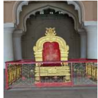
Thirumalai Nayaka Palace and Throne, Madurai

En route to Rameshwaram, we viewed the mighty Pamban bridge built across the Bay of Bengal, connecting the island of Rameshwaram to our mainland. We were amazed to see this engineering marvel, the longest bridge in India constructed over a bay. It is 2.05 kms long with a unique 72 m vertical split. We walked along the bridge and had a great view of the sea. It is India's first vertical-lift sea bridge and has been compared to famous bridges like the Golden Gate Bridge in the USA, Tower Bridge in the UK, and the Oresund Bridge between Denmark and Sweden