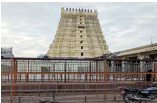
Meenakshi Ammal Temple, Madurai

of figures depicting stories from Indian mythology. We had a long wait before getting the darshan of Meenachi Ammal (as she is known in Tamil Nadu) and Sundareswaran. As I watched the beautiful deities with awe and reverence, my eyes filled up with tears involuntarily. The Aayiram Kaal Mandapam, Golden Lotus Tank, and the Hall of Thousand Pillars are some of the highlights of the temple. There is a strict dress code and mobiles phones or cameras are not allowed inside the temple. These must be kept within the lockers provided outside by the temple authorities.