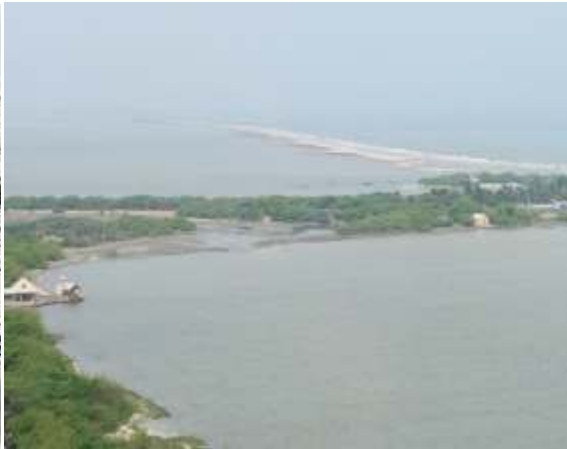
View of Rama Sethu in the Distance