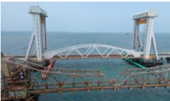
Pamban Bridge, Rameshwaram

En route to Rameshwaram, we viewed the mighty Pamban bridge built across the Bay of Bengal, connecting the island of Rameshwaram to our mainland. We were amazed to see this engineering marvel, the longest bridge in India constructed over a bay. It is 2.05 kms long with a unique 72 m vertical split. We walked along the bridge and had a great view of the sea. It is India's first vertical-lift sea bridge and has been compared to famous bridges like the Golden Gate Bridge in the USA, Tower Bridge in the UK, and the Oresund Bridge between Denmark and Sweden