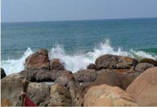
Glimpses of Dhanushkodi