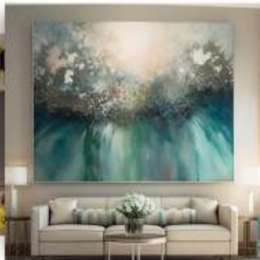
Painting & Decorations