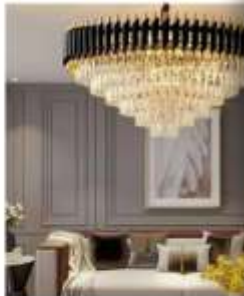
Wiring & Electricals

A one-stop solution for your home improvement requirements